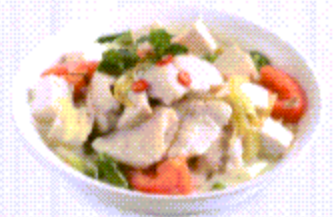
N60 味菜魚片湯米粉 15.9 Sliced Fish Marinated Pickle Vermicelli in Soup