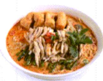
N56 雞絲叻沙 13.9 Chicken Laksa