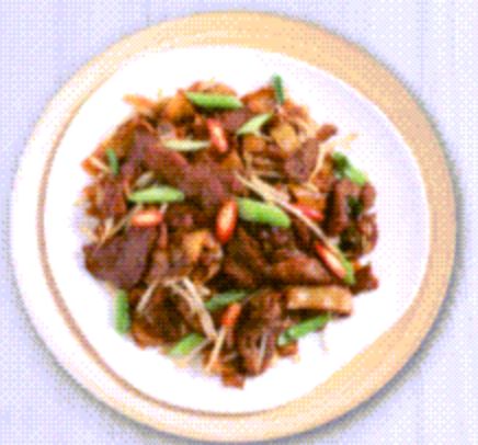
N07 乾炒牛肉河粉 14.9 Dry Fried Beef Hor-Fun