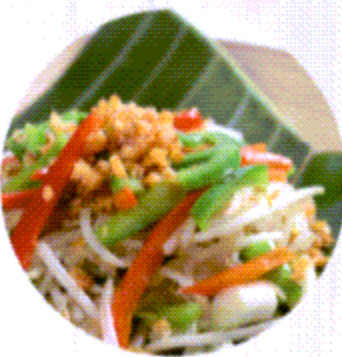
V02 鹹魚炒芽菜 13.9 Diced Salty Fish Stir Fried Bean Sprouts