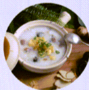
C04 皮蛋瘦肉粥 11.9 Congee with Century Egg & Pork