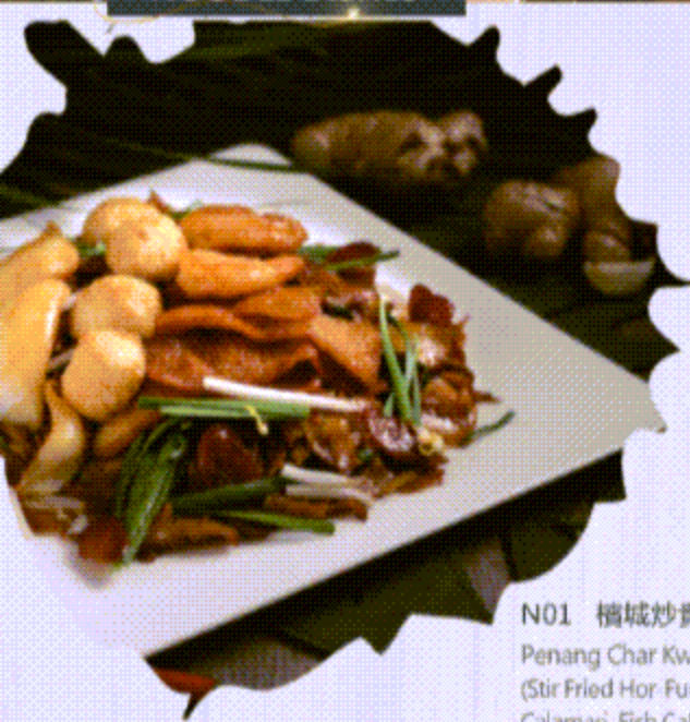
N01 檳城炒貴刁 14.9 Penang Char Kway Teow (Stir Fried Hor Fun with Prawns, Calamari, Fish Cake, Bean Sprouts & Chinese Sausage)