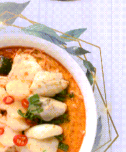
N52 海鮮叻沙 17.9 Malaysian Seafood Mixed Laksa (Hokkien Noodles and Vermicelli, Seafood Mixed & Bean Sprouts in Curry Soup)