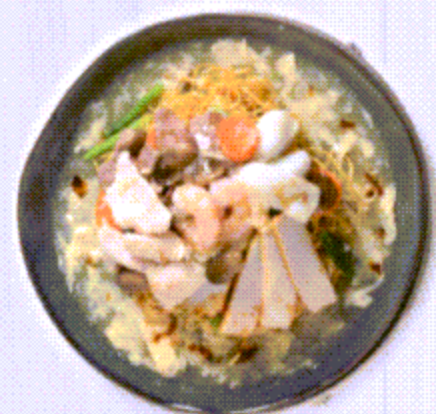
N12 雜燴滑蛋炒麵/河粉 16.9 Combination Wet Fried Crispy Egg Noodles / Hor-Fun in Egg Sauce