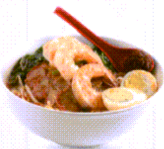
N59 檳城蝦麵(湯) 15.9 Penang Har Mee (Vermicelli and Hokkien Mixed Noodles, Prawns & BBQ Pork in Prawn broth)