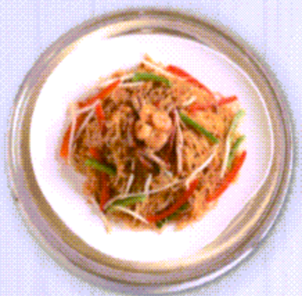
N06 星洲炒米 14.9 Singapore Noodles (Stir Fried Vermicelli with BBQ Pork, Shrimp, Egg Sliced, Tomato Paste & Bean Sprouts)