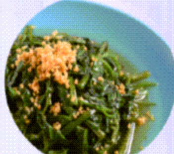
V10 通菜(蒜茸/馬來薑) 10.9 / 12.9 Kang Kong (Garlic or Balachan)