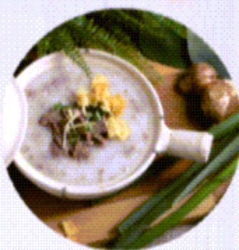
C02 生滾牛肉粥 11.9 Sliced Beef Congee