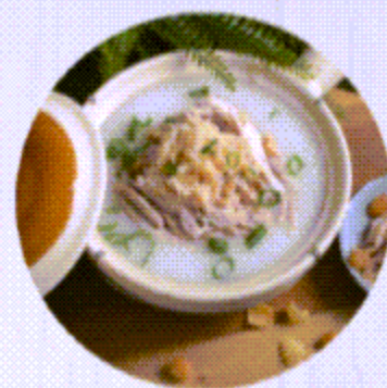
C03 瑤柱雞絲粥 12.9 Scallop Chicken Congee